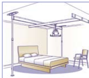
The 3 post Easytrack with wall bracket