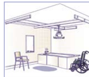
The 3 post Easytrack without posts