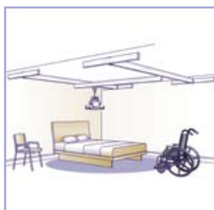
An x-y system without posts and with 4 wall brackets.