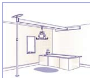
The 2 post Easytrack with wall bracket