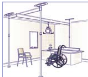
The 3 post Easytrack with bath bracket