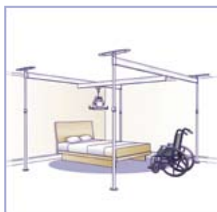
The 4 post Easytrack operates like a traditional x-y system covering all 4 corners of a room. The 4 post is not telescopic