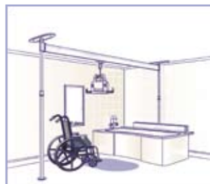
The 2 post Easytrack with bath bracket