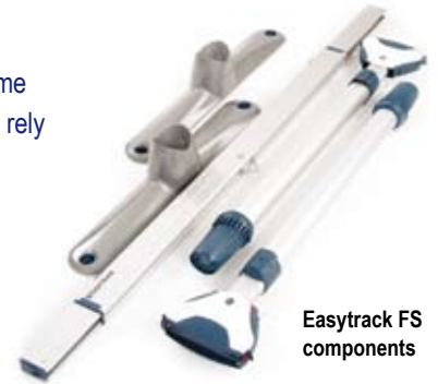
Easytrack FS components