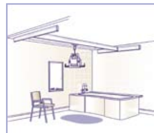
The 2 post Easytrack without posts