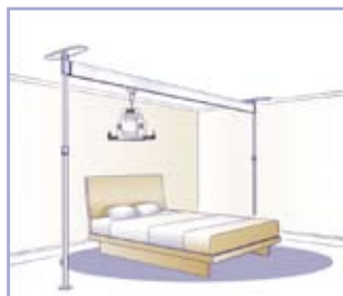
The 2 post Easytrack

The standard 2 post Easytrack is suited for transfer over a bed or bath in a peninsular setting: