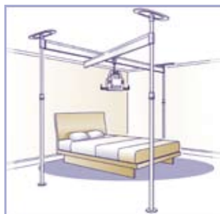
The 3 post Easytrack

The 3 post Easytrack is suited for transfer over a bed or bath and down a room. This system negates the need for a traditional curved track: